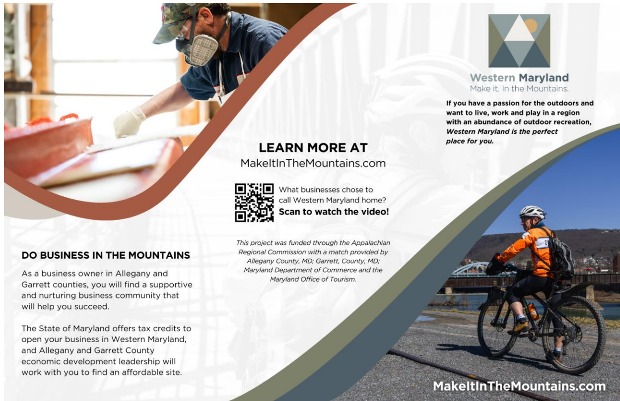
Figure 6: Brochure