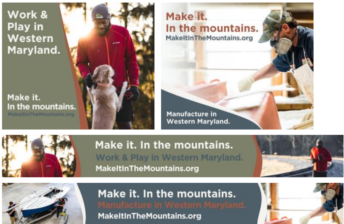
Figure 2: Example digital ads

Figure 2, Figure 3, and Figure 4 provide sample designs for digital ads, print ads, and billboards. These designs integrate the tag line with original photographs from the photo bank and use the color palette shown in Figure 5. This palette uses muted earth tones to convey the manufacturing aspect of this marketing effort, as well as the outdoors. Some colors may be used as accents only.